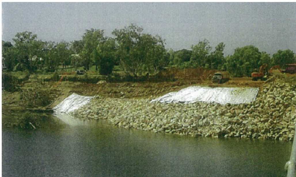
Figure 2.6: Rock wall protection to river bank being installed at Fitzroy Crossing, Western Australia

2.36 A further example related to the March 2011 monsoonal flood and trough event which affected the Derby, Wyndham and Halls Creek areas in the Kimberley Region [AGRN 440] of Western Australia. The state's claim included $2 441 927 for restoration works for the Great Northern Highway Fitzroy River Crossing. However, the supporting documentation provided by Main Roads Western Australia (MRWA) revealed that the Fitzroy River Bridge remained undamaged during this flood event. As shown in Figure 2.6, the amount claimed was actually to install extensive rock protection to the river bank to minimise future erosion and scouring (upstream near the south eastern end of the bridge, extending towards the Fitzroy Lodge). This is mitigation and enhancement work rather than the restoration of an asset to its pre-disaster standard and as such is not eligible for NDRRA reimbursement. 39