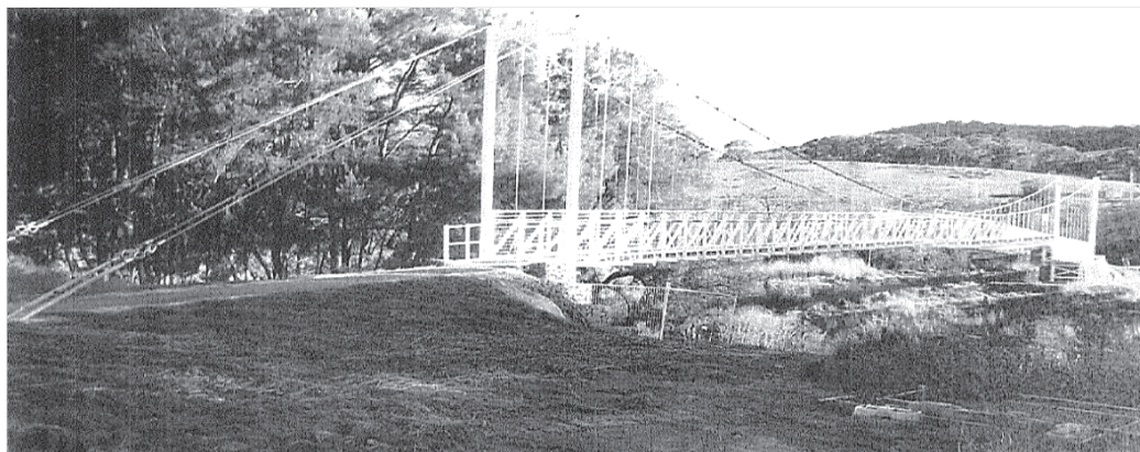
Figure 2.4: Tuena Creek footbridge, after rebuilding