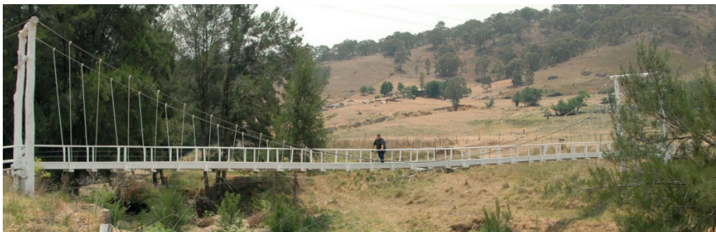
Figure 2.2: Tuena Creek footbridge, Tuena, NSW (before flood damage)

2.33 For example, the suspension footbridge over the Tuena Creek in Tuena was damaged during the NSW floods event that occurred in late-November 2010 and affected 53 LGAs and the state's 'unincorporated area' [AGRN 421]. The original bridge was constructed in 1894. As it had also been damaged by floodwaters and repaired many times over previous years, rather than repairing the bridge, the Upper Lachlan Shire Council decided to replace it with a similar design, but to be built at a higher level to provide more protection from future floods. The new footbridge is now 1.5 metres higher and 15 metres longer (7.5 metres longer at each end) than the previously existing structure, at a (NDRRA) claimed cost of $421 484 (see Figure 2.2, Figure 2.3 and Figure 2.4). Although there were significant enhancements to this asset (including an increase in overall length and disaster resilience), no council contribution was made for the costs of the upgrades that extended beyond the like-for-like repair of the bridge (and no betterment application was submitted to the Commonwealth).