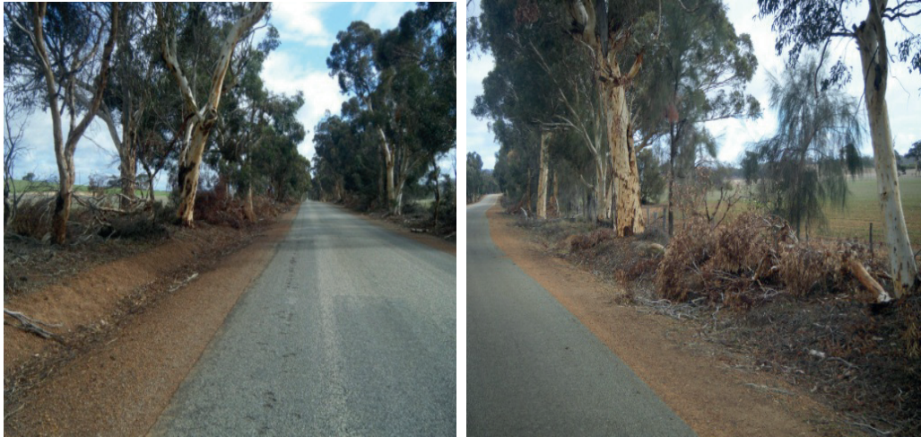
Figure 2.1: Tree debris pushed to side of the road, Shire of Cuballing, Western Australia