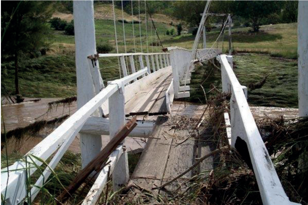
Figure 2.3: Tuena Creek footbridge, flood damage