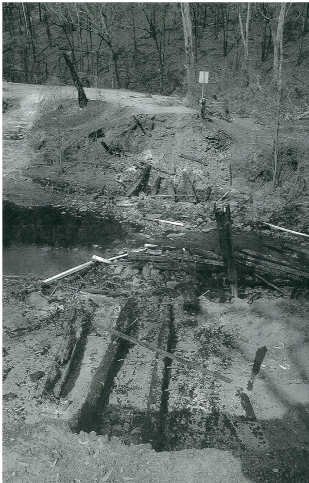
Figure 2.5: Barkly River Bridge destroyed by fire, Licola, Victoria

... The $36 000 referred to within contract documentation is in relation to the bridge abutment construction, an integral part of the bridge structure, as opposed to the road approach. Approach earthworks were undertaken, as a method of both providing small improvements to approach geometry in line with design guidelines for new and replacement bridge structures and as a means of gaining access to natural materials suitable for associated civil works at the bridge abutments that were otherwise unavailable for a great distance. Given the nature of these works, it was agreed in discussions between VicRoads representatives and Council staff that an amount of $15 000 was attributable to any improvement outcomes that arose from these activities and this amount was subsequently paid by Wellington Shire Council.