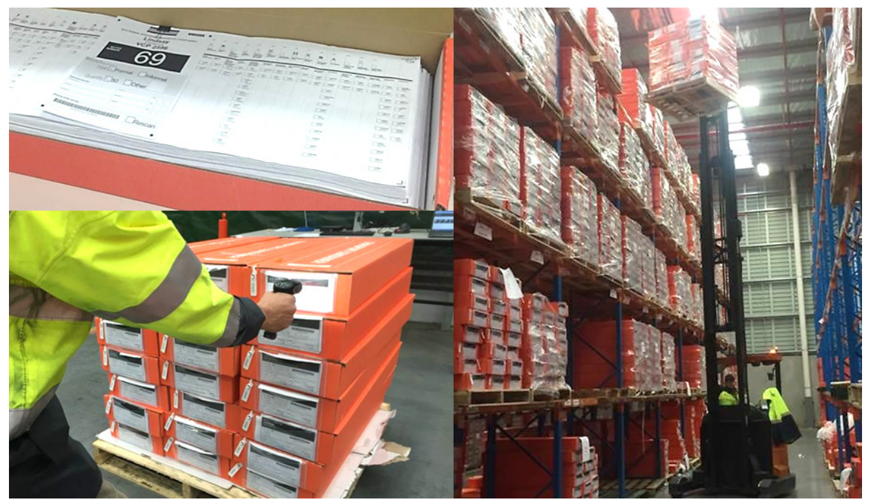
Figure 3.1: Tracking and storage of ballot papers at Senate scanning centres