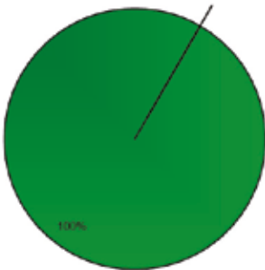
Pie Chart: Percentage Breakdown of Materiel Capability Delivery Performance