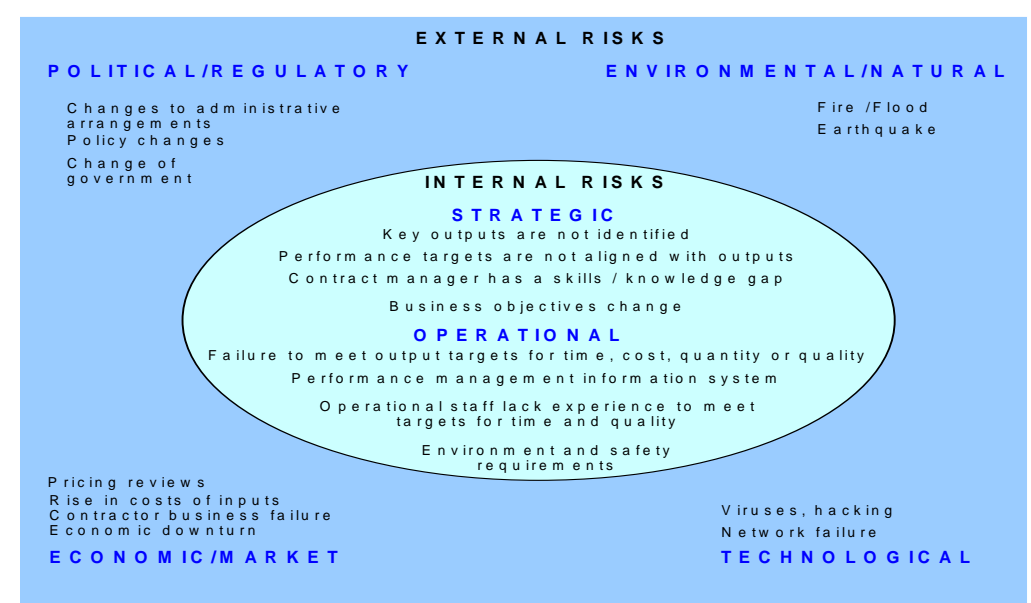
Figure 1: External and Internal Risks

The difference between a contract delivering benefits, and one that does not, can be often attributed to the way that the risks associated with the delivery of those services are managed.<sup>99</sup>