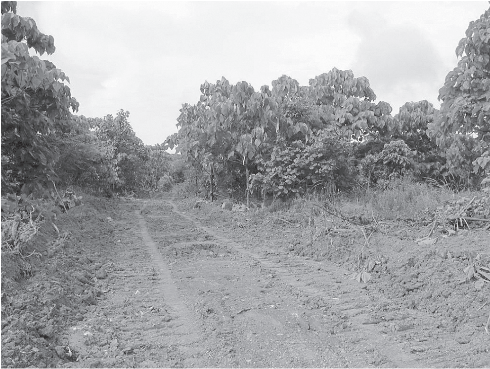
Close up view of bulldozer track through the rehabilitated area on Christmas Island.