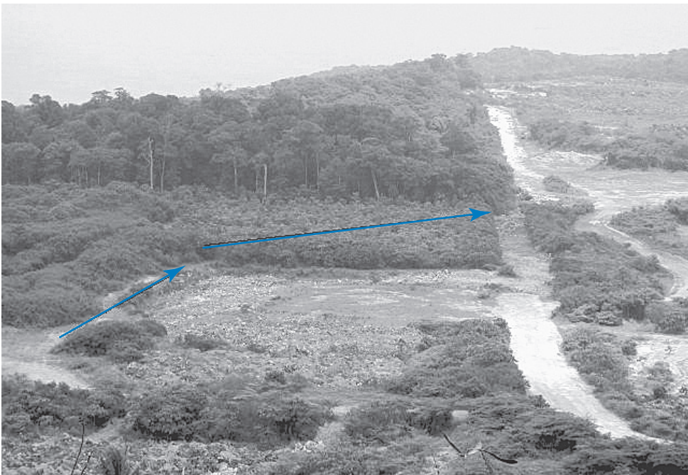
Aerial view of the site. The arrows indicate the bulldozer track. This action has essentially cut the block of rehabilitated land in half. The area of primary forest is immediately behind the site.